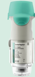
Spiriva Respimat tiotropium LAMA