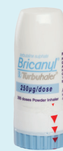
Bricanyl Turbuhaler terbutaline