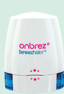
Onbrez Breezhaler indacaterol LABA (multiple strengths)