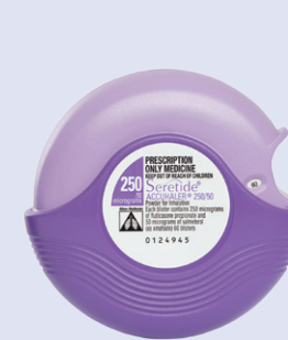
Seretide Accuhaler fluticasone with salmeterol (multiple strengths)