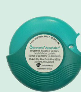
Serevent Accuhaler salmeterol LABA