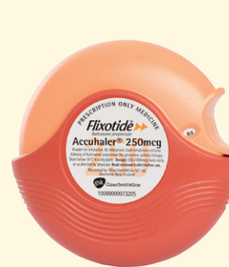
Flixotide Accuhaler fluticasone (multiple strengths)