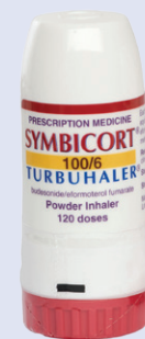
Symbicort Turbuhaler budesonide with formoterol (multiple strengths)