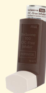
Beclazone beclomethasone (multiple strengths)