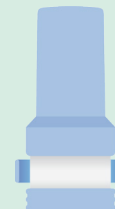
Foradil formoterol LABA