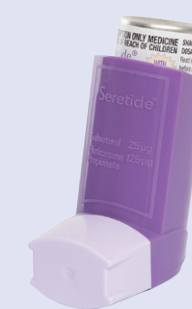
Seretide fluticasone with salmeterol (multiple strengths)