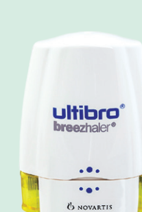
Ultibro Breezhaler glycopyrronium with indacaterol LAMA/LABA