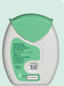
Incruse Ellipta umeclidinium LAMA