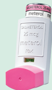
Meterol salmeterol LABA