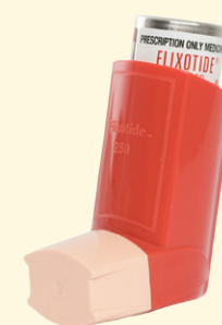
Flixotide fluticasone (multiple strengths)