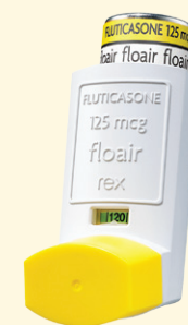
Floair fluticasone (multiple strengths)