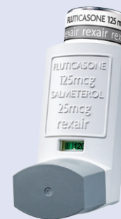
RexAir fluticasone with salmeterol (multiple strengths)