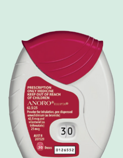
Anoro Ellipta umeclidinium with vilanterol LAMA/LABA