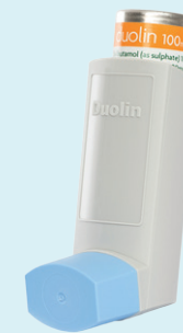
Duolin salbutamol with ipratropium