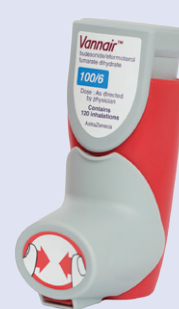
Vannair budesonide with formoterol (multiple strengths)