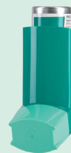
Serevent salmeterol LABA