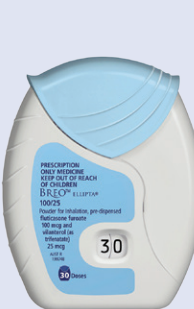
Breo Ellipta fluticasone with vilanterol