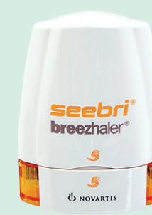
Seebri Breezhaler glycopyrronium LAMA