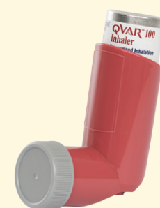
QVAR beclomethasone (multiple strengths)