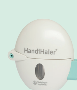
Spiriva Handihaler tiotropium LAMA